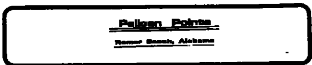
EXHIBIT "C", PAGE 7